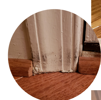
Unfinished doorways are unsightly with rough, uneven edges

Builders routinely use baseboard and shoe moulding to finish rooms, but they DO NOT finish the doorways.