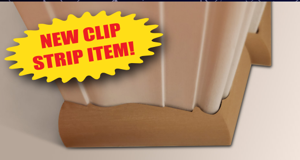
DSM contour-matched to CM376 casing