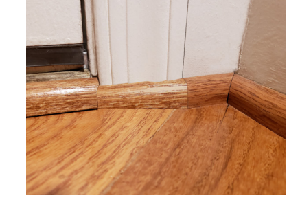
DSM on Pocket doorway